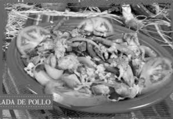
ENSALADA DE POLLO

Your choice of shredded chicken breast or ground beef in an edible taco shell bowl topped with cheese dip, lettuce, tomatoes and sour cream.