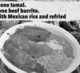
COMBO 31 "EL AZTECA"